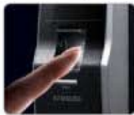
Biometric Access System