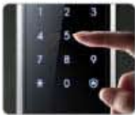
User Access Code