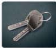
Mechanical Override Keys