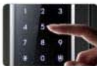
Press the user access code