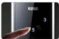
2 random numbers appear before entering user access code