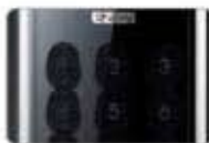
Impossible to guess user access code due to random fingerprint marks